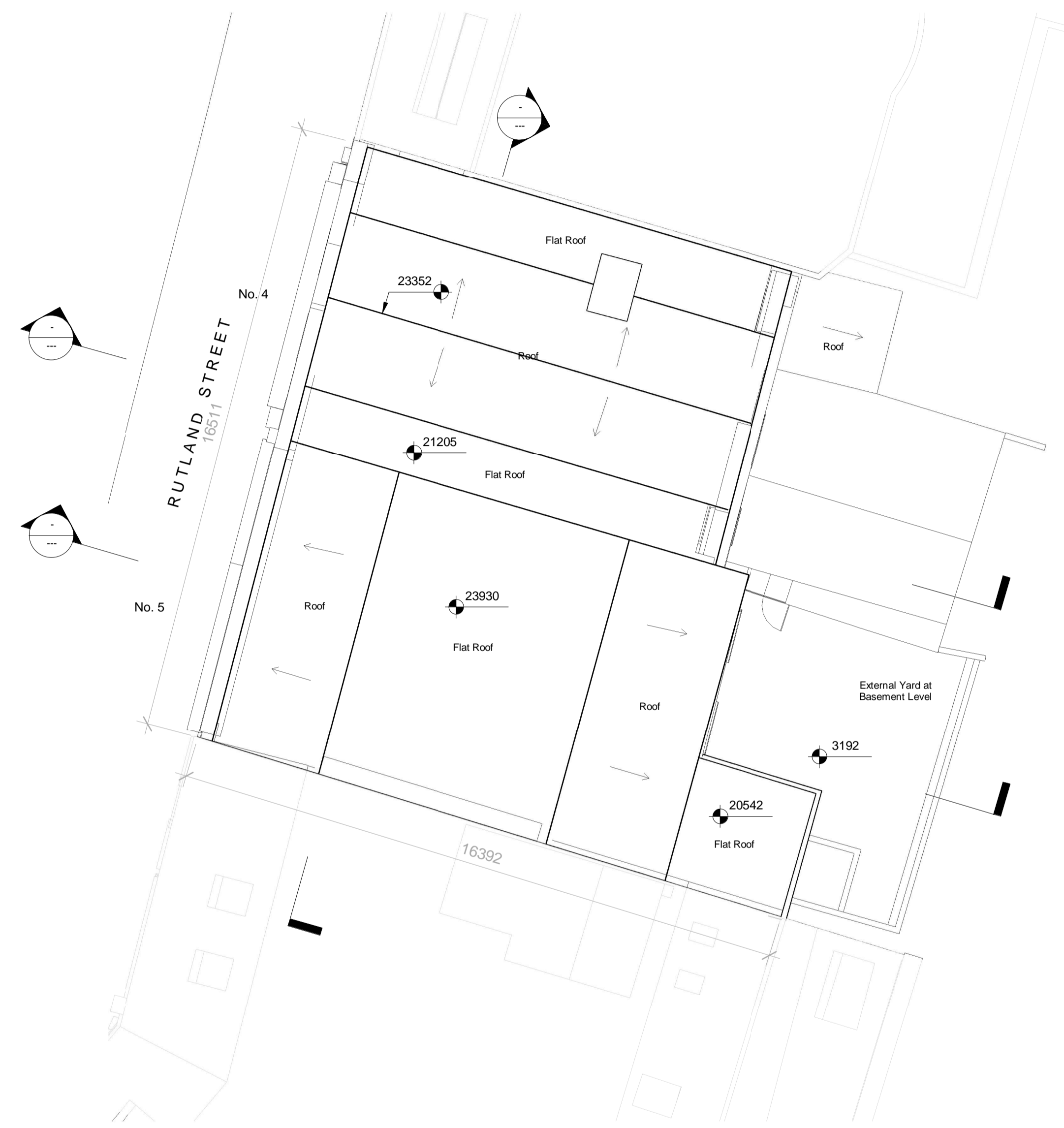
2 Existing Roof Plan SCALE: 1 : 100